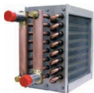
Commercial Replacement Coils Tel: 800-225-4328 Fax 662-229-4212