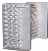
Aluminum Coils Tel: 662-229-2587 Fax 662-229-2571